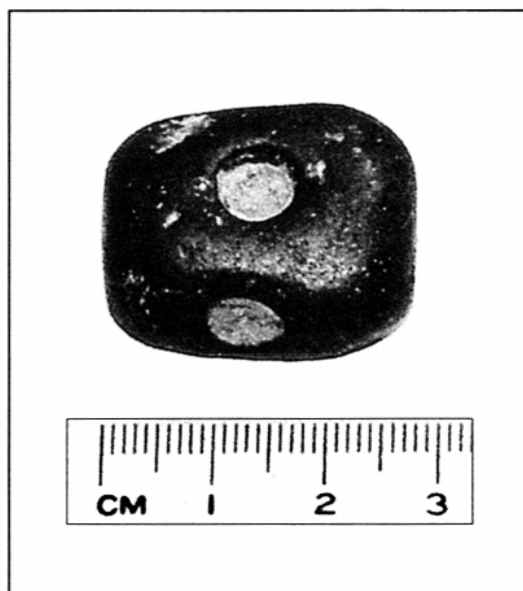
Fig. 2. An Olmec bead. The rectangular shape and polished sides are typical of these three-thousand-year-old stone beads. Over time, the holes drilled through the bead have filled with sand.

Our sample consists of five whole artifacts, some broken fragments, and a quantity of unworked ore. A striking feature is that the surfaces of the objects are smoothed and polished. Some surfaces remain quite shiny, even though three millennia have elapsed since their manufacture. The worked beads are rough parallelepipeds 11 about 2 cm x 2 cm x 3 cm. Each has a large primary hole and two smaller holes drilled perpendicular to the primary hole. The corners and surfaces are smoothed and polished and generally have a metallic luster. The broken fragments reveal the boreholes, aiding our study (fig. 2).