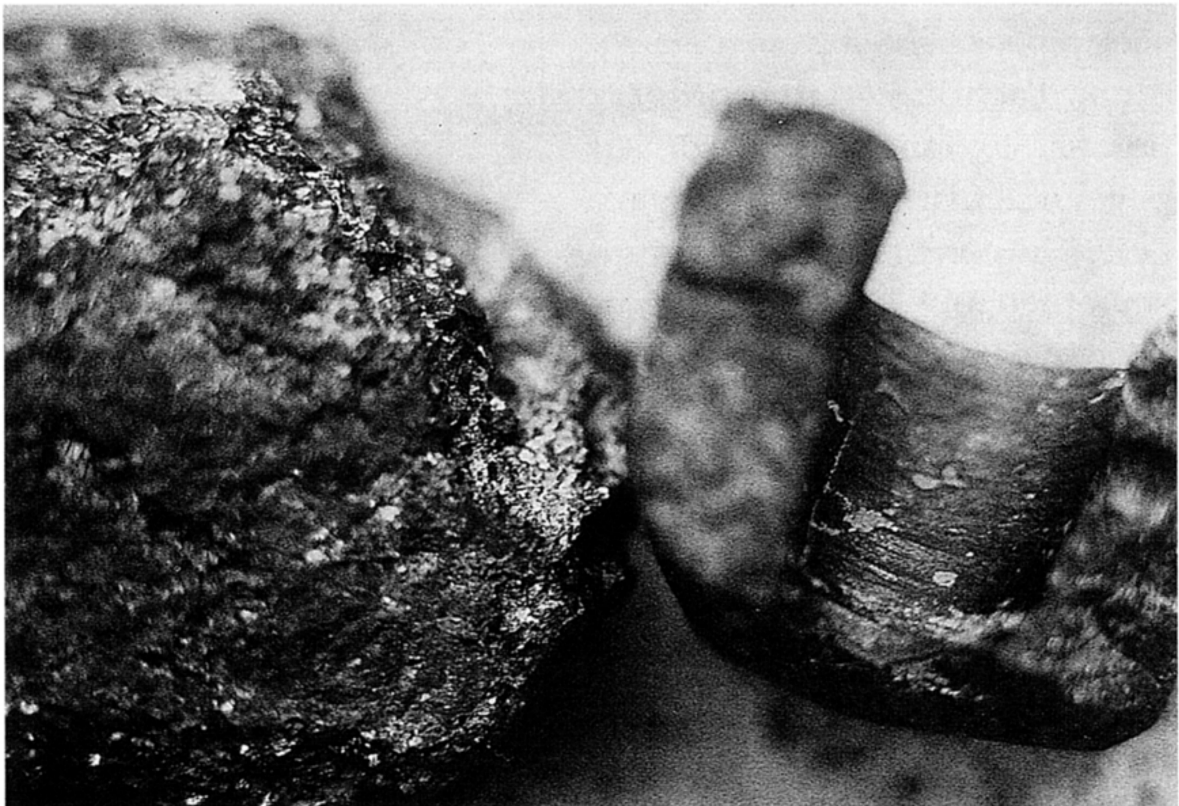
Fig. 3. Ilmenite ore and broken bead. The broken bead, on the right, reveals the circular pattern made by a drilling tool.

Scratch markings in the boreholes clearly demonstrate circular patterns. The observed circular patterns show that the holes were almost certainly drilled by a tool operated in a rotating manner, implying considerable sophistication when one considers the hardness of the material. One observes also a prominent raised point in the center of an incomplete borehole (fig. 4). This suggests