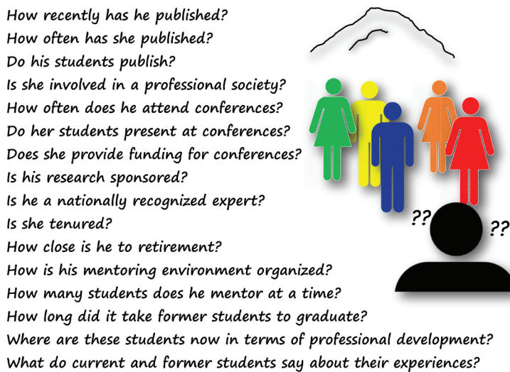
Figure 5. Some issues to consider for would-be student mentees when selecting a mentor.

Lab environment is a critically important issue as well. Is the atmosphere relaxed or formal, collaborative or competitive? There is no one best model, but it is imperative that the mentee ensure in advance that the environment is the kind that will be best for his/her own personality and way of working. Ultimately, the mentee must decide for himself/herself whether the mentor is going to be someone who will make