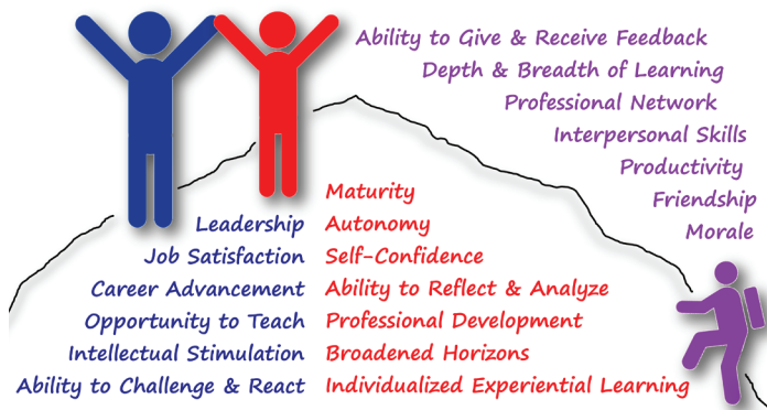
Figure 2. Areas of mentoring benefits for the mentor (blue), mentee (red), and both (purple), leading to benefits for the organization and future mentees.

Is it worthwhile to deliberately work to become an effective mentor? Thankfully, the documented benefits of mentoring are numerous. There are clear benefits to the mentee, the mentor, and the “organization,” which could variously mean the research, academic program, university, research sponsors, future employers, and future mentees.